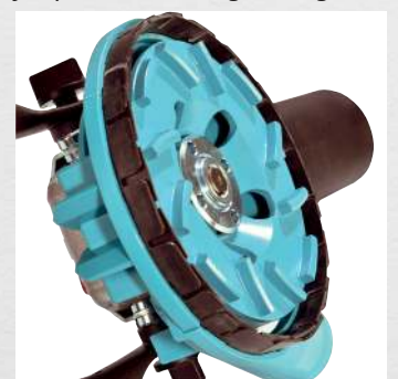
Closed lamellar ring for low-dust working*