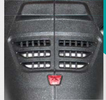
Visual performance monitoring as overload protection