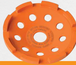
GST 125 Grinder