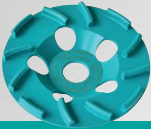
BST 125 Cyclon

for concrete grinder CMG 1700 (∅ 125 mm)