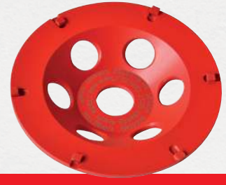
PST 125 Strap-it