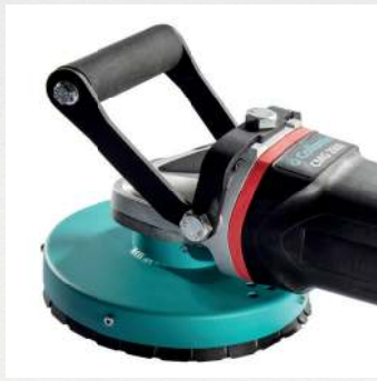
Comfortable grip for an optimum hold and safe grinding