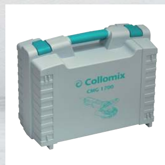
Robust case for safe and practical storage