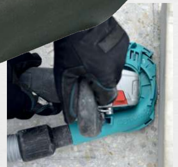
Practical segment opening for precise working on edges