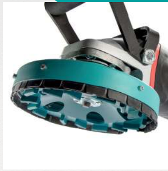
Closed lamellar ring for low-dust working*