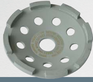
UST 125 Universal